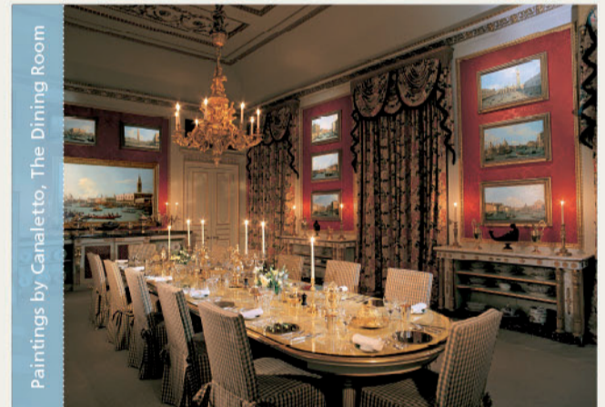
Paintings by Canaletto, The Dining Room