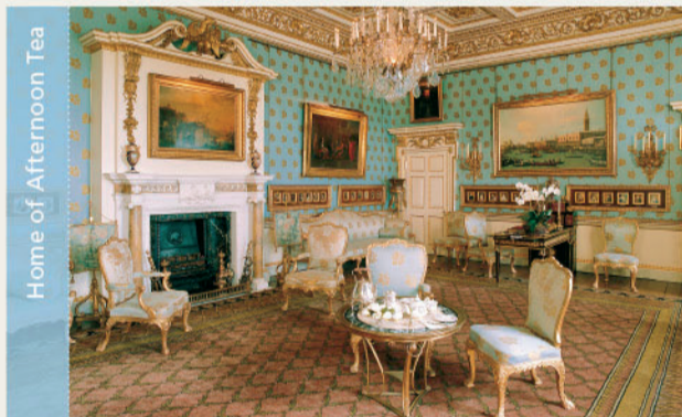
Home of Afternoon Tea