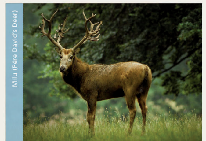
Milu (Père David's Deer)

Look out for the Sika, Axis or Chital Deer, the Barasingha who graze in the area around the Paris House Restaurant and the rare Rusa Deer. Small Muntjac and Chinese Water Deer roam individually.